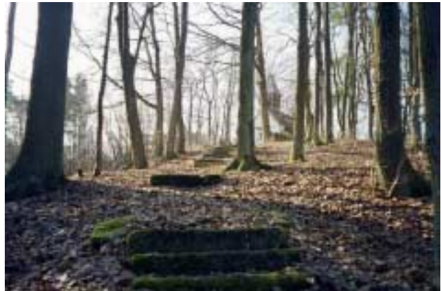
The old pilgrim way connects the lanes.