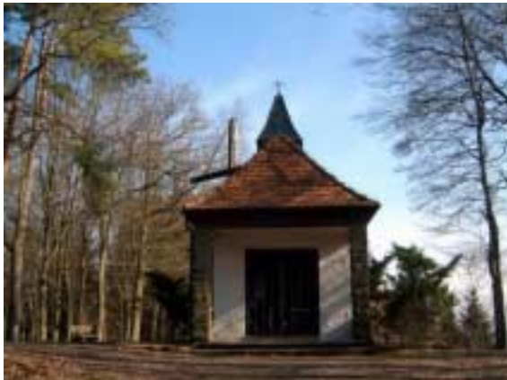
The St. Barbara Chapel: the Start.