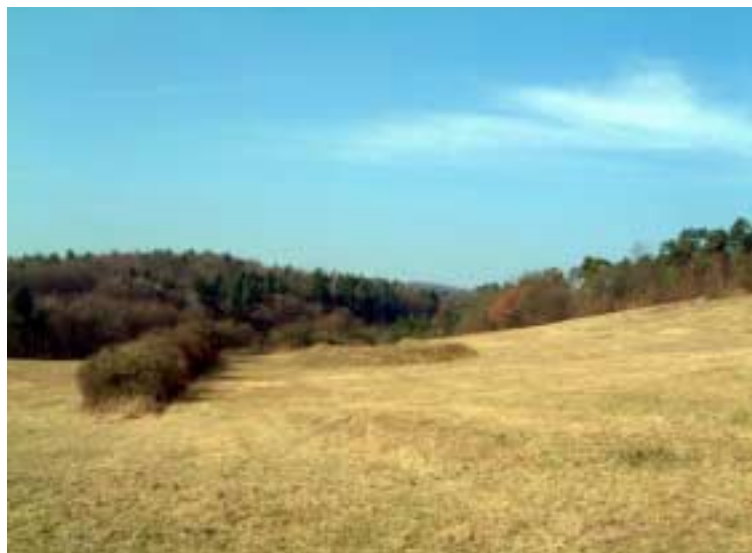
This is the place of the zeroing range.